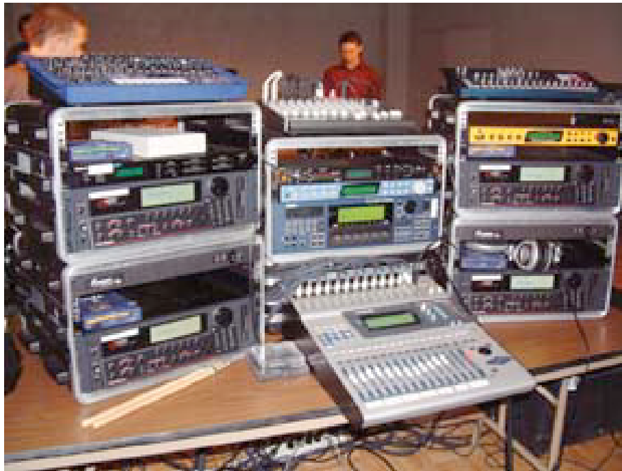
CrossTalk's collection of sound modules used during the shooting of “Alias: The Videos”

Attention to the subtleties of sound is a trademark of any accomplished musician. The ability to control and manipulate sound requires the ability to listen critically and identify sonic nuances to a fine degree. By spending time shaping electronic sounds, students can hone listening skills that then transfer well to the acoustic realm. Choosing the appropriate sound in an electronic context is similar to the challenge of choosing the right triangle or cymbal; the instrument that sounds best